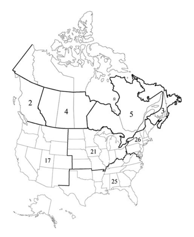
FIG. 1. Geographic location of surveyed mothers of infants with phenylketonuria living in the United States and Canada.

Several factors were assessed in relation to the duration of breastfeeding using \chi^2 analysis. Only one variable—the timing of when standard commercial infant formula was added