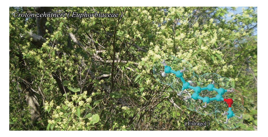
Figure 1 - Photo of a specimen of Croton zehntneri (Euphorbiaceae), showing branches and inflorescence, and structure of estragole.

Because of the potential activities of the essential oil of Croton zehntneri collected in different regions of Brazil (Morais et al. 2006), and possible carcinogenic and genotoxic activity documented in the literature, we decided to determine the chemical composition of the essential oil from C. zehntneri from Simões city - Brazil, and evaluate the antimicrobial and cytotoxic activities of its main component: estragole (iv).