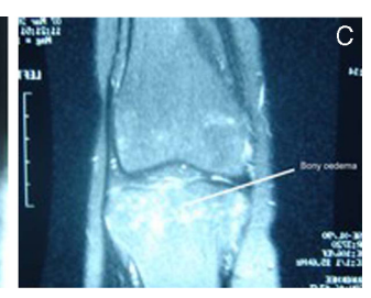
Figure 2 (A) MRI demonstrating stress fracture of talar dome. (B) Normal ankle x-ray taken at a similar time. (C) Bony oedema affecting tibial plateau.

and exercised regularly walking up to 6 miles. She took paracetamol 4 g and codeine 240 mg daily.